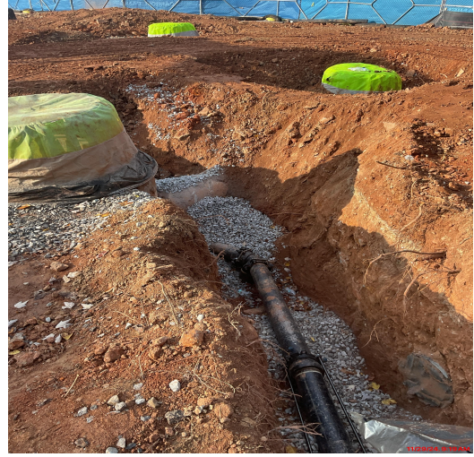
Installing fire line