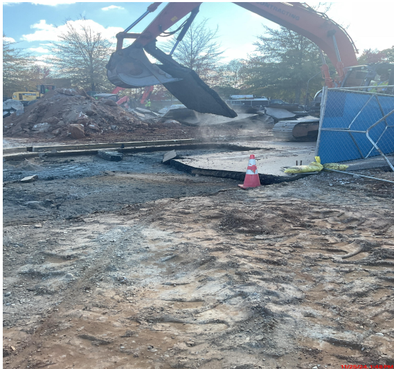
Demo at bus route area