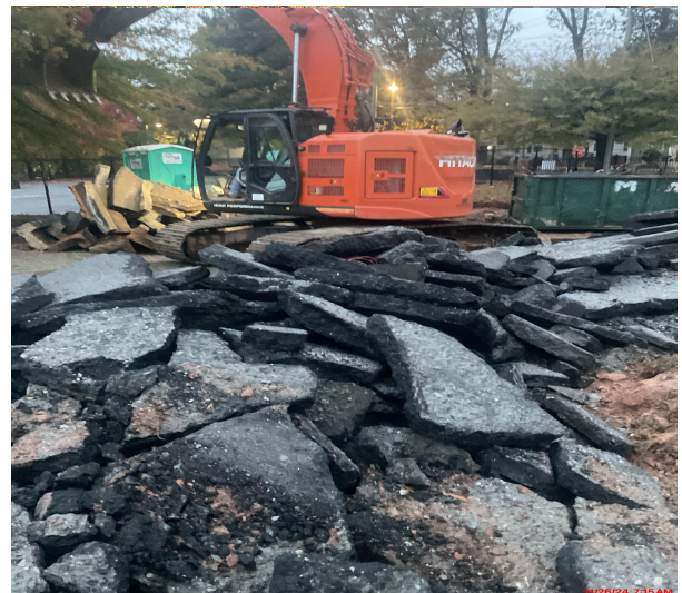
Asphalt in lay down area ready to be hauled off