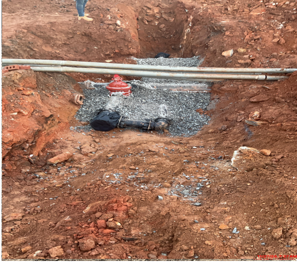
Installed fire line valve at tap